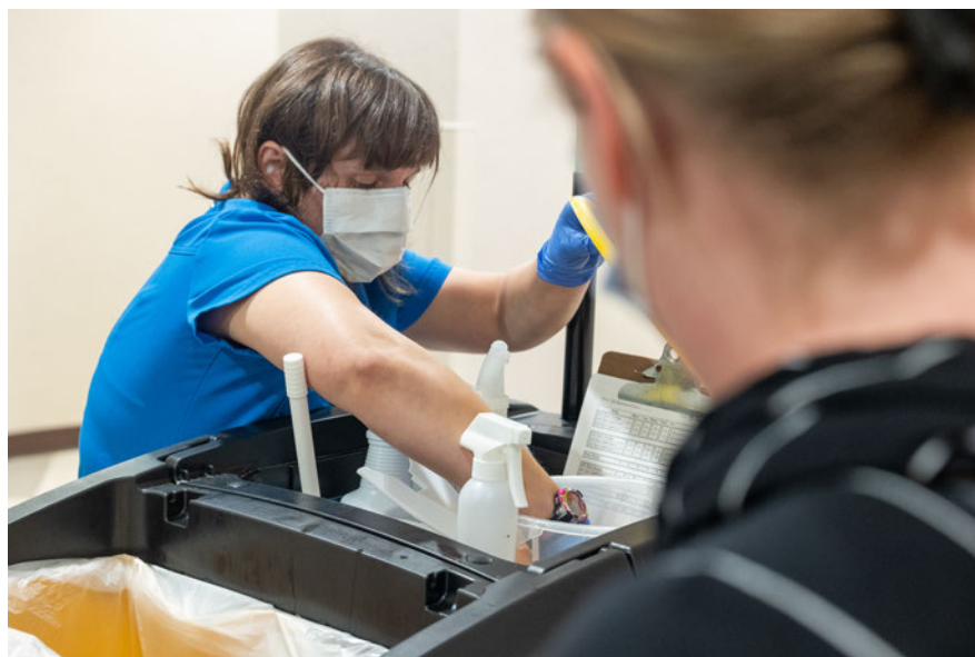
AURORA BAYCARE MEDICAL CENTER

Project SEARCH® participants are immersed in a business environment five days a week, where they learn a variety of job skills during three 10-week internship rotations, as well as employability skills through classroom training.