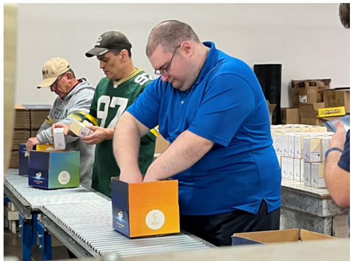
QUALITY MAIL MARKETING