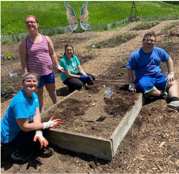
VOLUNTEERING-GREEN BAY BOTANICAL GARDEN

Supporting people in small group activities to explore career options, identify their preferences and goals, develop life skills and be involved in their communities in meaningful ways.